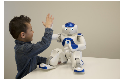
Figure 1: A child interacting with the Nao robot.

One significant drawback in many of these past studies is that the robots tend to be teleoperated or use purely scripted behaviours with limited autonomy and responsiveness, thereby reducing the overall flexibility and robustness of the system. Such approaches also limit the ability to personalise or adapt the system to different user groups (e.g., children, parents of children undergoing medical pro-